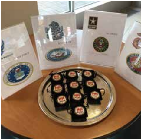
Veterans Day celebrations were held on campuses and at regional hospitals throughout NYP. Employees who are veterans were presented with commemorative coins and lapel pins.